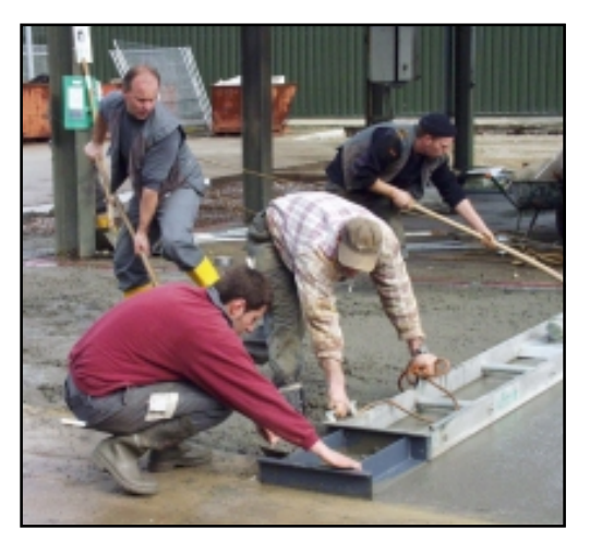
...at DRMO Bitburg.

The DRMO supports a far-flung customer base. "We have local Air Force customers at Spangdahlem, and Bitburg, as well as Army, Navy, Air Force and NATO units in Luxemburg, Holland, Sweden, Belgium and Finland," said Vaughn.