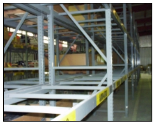
Empty shelving tells a vivid tale of today's DRMO Nuernberg: The level of property being turned in doesn't support keeping the facility open.

The tan building with brown roofing at the right of the picture is part of the DRMO. It's the last pre-WWII building still standing in what was once a sprawling U.S. Army Base, Johnson Barracks.