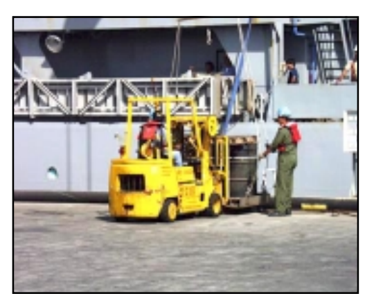
The pierside hazardous waste off-load begins.