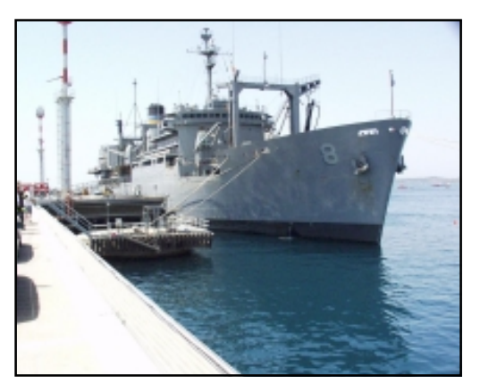
USNS Sirius moored at Augusta Bay, Italy.

The inport pickup promotes clear sailing for the Navy And a clean bill of health for the environment